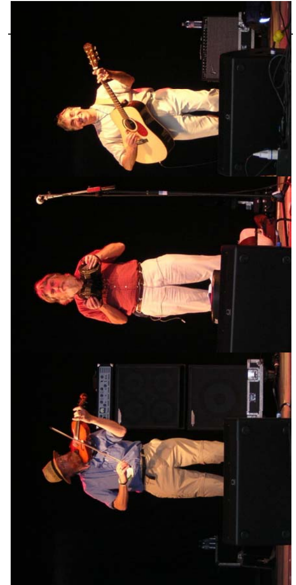
On stage at The International Festival of the Sea Portsmouth (2005)