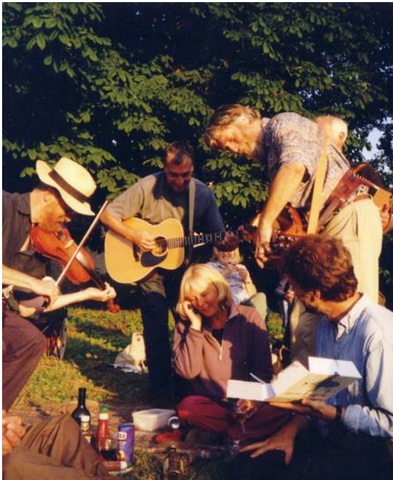
Garden Party, Bathford (2002)

The Band plays in all types of venues and situations. We can play acoustically if required, or amplified using radio microphones. This gives the band freedom to move about and entertain wherever required.