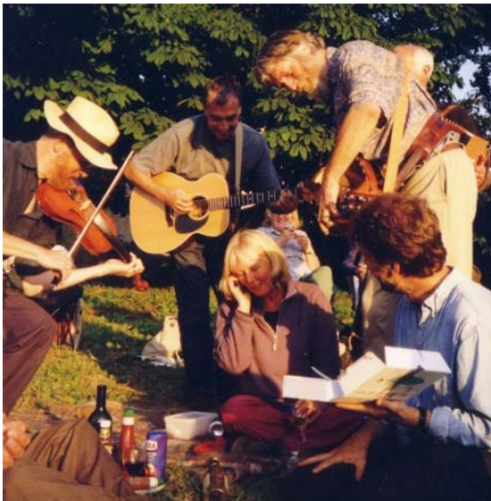
Garden Party, Bathford (2002)

The Band plays in all types of venues and situations. We can play acoustically if required, or amplified using radio microphones. This freedom gives us the opportunity to meet people and join in the fun and festivities. We often play for garden parties, fetes and festivals and enjoy entering into the spirit of the occasion